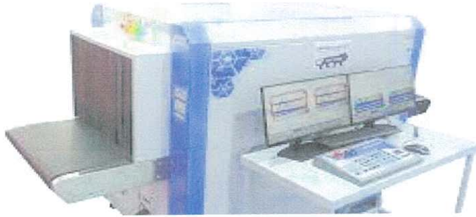
1000 AMX Dual View